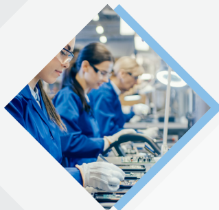
Tools, jigs & fixtures for electronics industry

Ultrasint® PA11 ESD is the optimal material for the production of individualized ESD-safe prototypes, tools, and small series parts.